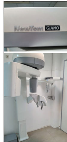
Figure 1: NewTom GiANO

Figure 3 shows all the linear and angular measurements. According to the methodology of Imani et al. (2019), each parameter was measured in duplicate and the mean value was recorded. The data were analyzed using SPSS version 23 (SPSS Inc., IL, USA). Descriptive statistics including the mean and standard deviation values were reported. The mean values of cephalometric parameters according