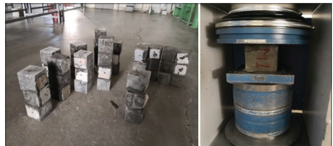
Figure 3: Cubes and compressive strength test machine

The compressive strength development at various curing ages for all types of concrete is presented in Table 7.