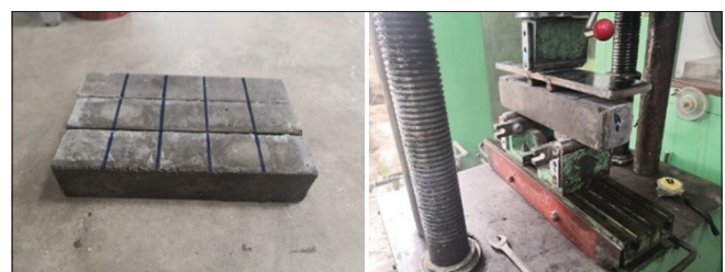
Figure 5: Prisms and testing machine