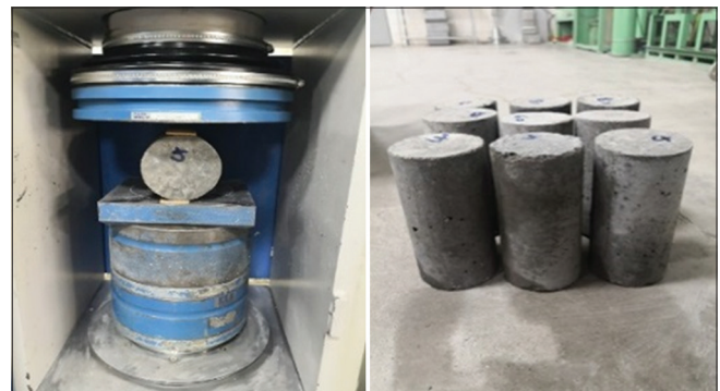
Figure 4: Cylinders and testing machine