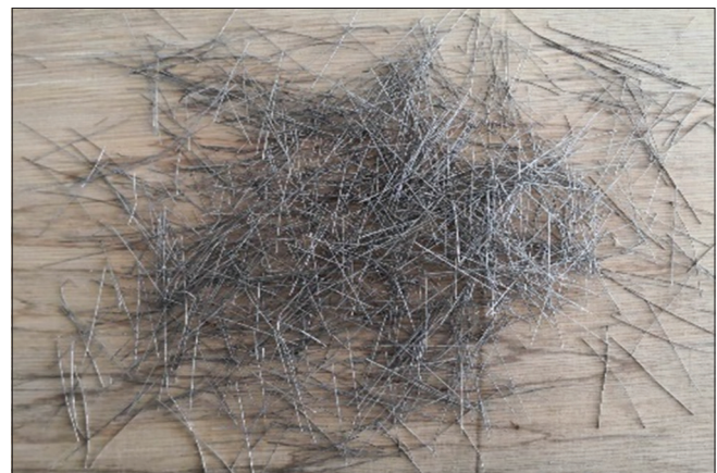
Figure 2: Steel fiber